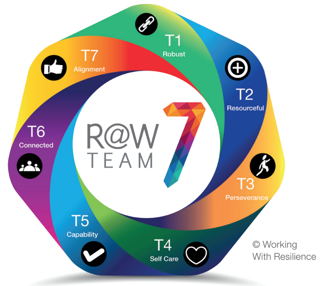
Figure 3: R@W® Team model

In practice, many practitioners use the aggregate of the resilience of individual group members as a measure of team resilience. The R@W Team model (Figure 3) addresses this gap. 17 It highlights seven factors that assist a team to perform optimally while staying well. Once again, it's about being able to sustain success over the longer term.