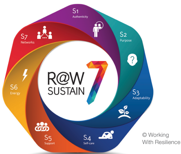
Figure 2: R@W® Individual Model

The R@W Individual model, also known as the Sustain 7 (Figure 2), has seven components (resources) that contribute to our personal resilience. Neuroscience tells us the more resources we have, the better equipped we are to manage both adverse situations and everyday demands. The idea is then that we invest in as many of the seven components as we can.